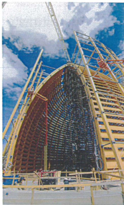
Given the asymmetry of structure and the curvature of the interior and exterior walls, very few connections were the same. As a result, AutoCAD 3D was utilized to model 220 unique connections.

First, the committee determined that the glulam timbers must remain elastic under cyclic load conditions. Second, all of the ductility of the system was required to come from the pre-tensioned steel rods. This required ductility testing of the tension members to demonstrate that they could achieve 2.1 percent elongation over the entire length of the rod, not just at the threaded ends. The rod manufacturer, Halfen Anchoring Systems, tested all five rod diameters. The initial testing pointed out that the two largest rod diameters did not meet this requirement as the elongation was limited to the threaded portion of the rod. Halfen therefore re-tooled their machinery to upsize the threads on these rods and achieved the required elongation. The resulting stress strain curves of the testing were input into the SAP2000 computer model to define nonlinear behavior of the structure. Third, the rods were required to be pretensioned to between 3 and 10 percent of their yield stress so that they were never loose and would be in tension immediately when loaded with seismic forces. The glulam supplier/erector, Western Wood Structures Inc. (WWSI), Tualatin, OR, developed an ingenious tightening sequence to eliminate force interference between rods. Without this sequence, tightening one rod would affect the forces already applied to all the other rods, tightening some and loosening others. WWSI also developed