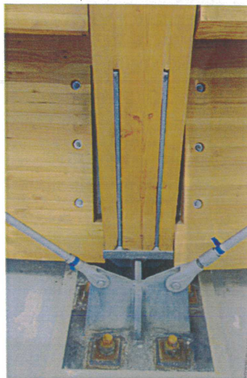
Double kerf plates and hidden 1" steel pins were used to connect the ribs and mullions. These intricate connections were shop fabricated for ease of construction.