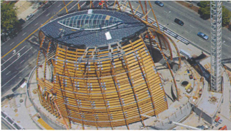
The oculus "skylight" weighs 24 tons. It had to be positioned exactly on target and then braced to prevent movement during installation of the glulam structure.