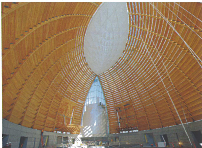
The floor plan of the building is in the shape of a Vesica Pisces creating a unique spherical elevation. The Vesica Pisces is a shape of religious significance, two intersecting circles of the same radius, connected in such a way that the center of each circle lies on the circumference of the other.