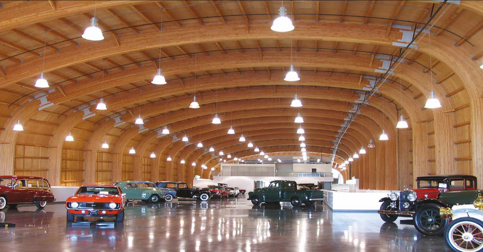
LeMay - America's Car Museum | Tacoma, WA