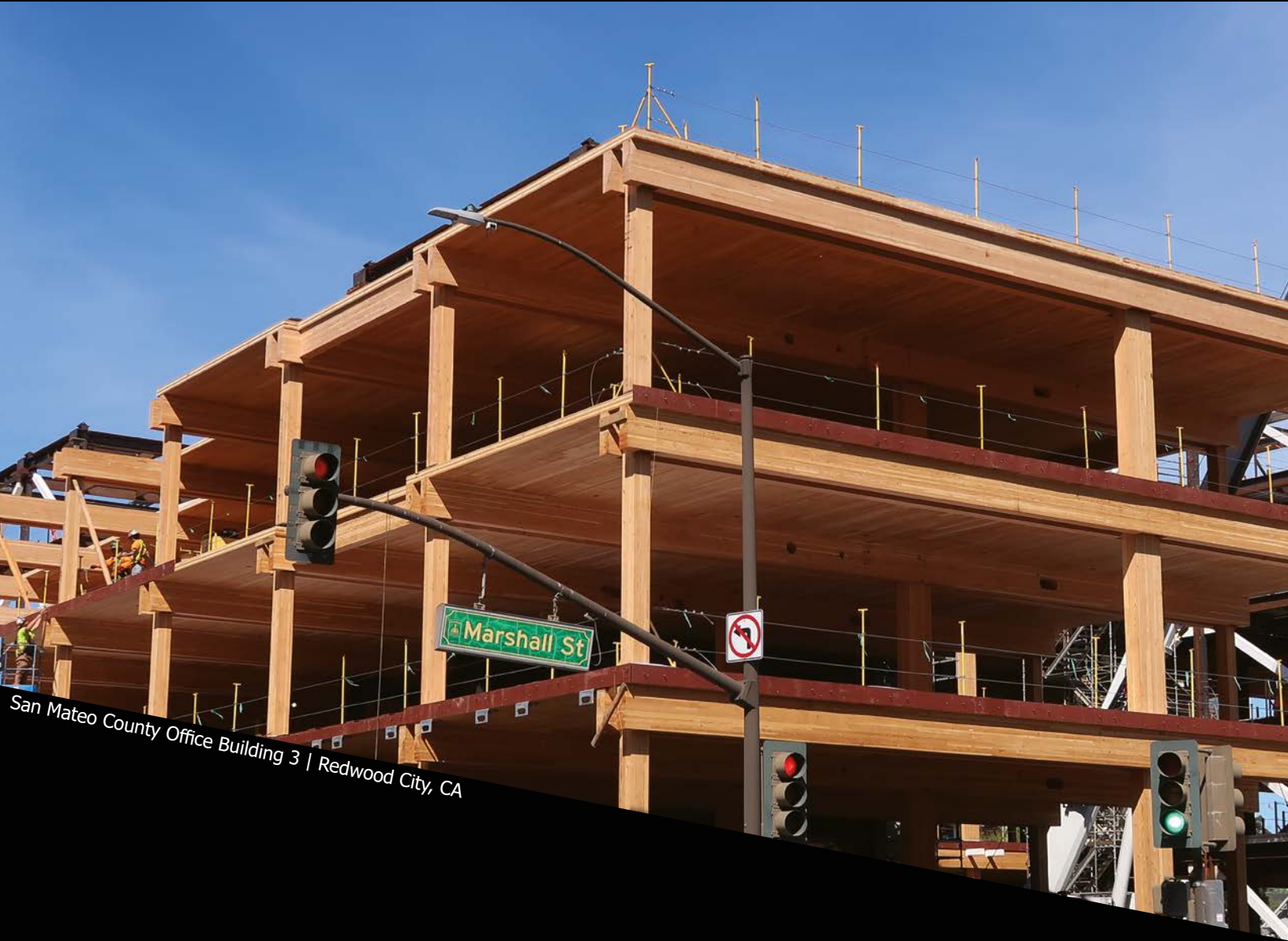
San Mateo County Office Building 3 | Redwood City, CA