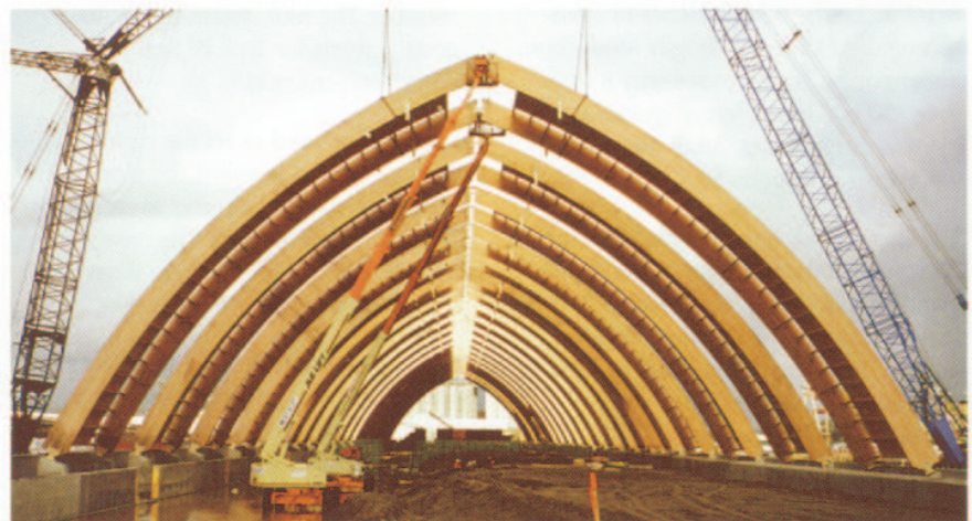
The 236,000 square foot potash storage building in Portland, Oregon features APA EWS glulam arches in its design.

P.O. Box 130 TUALATIN, OR 97062-0130 (503) 692-6900