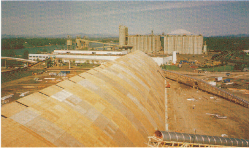
Nearly 350,000 board feet of 1-1/8" tongue-and-groove APA plywood sheathing was used in the project.