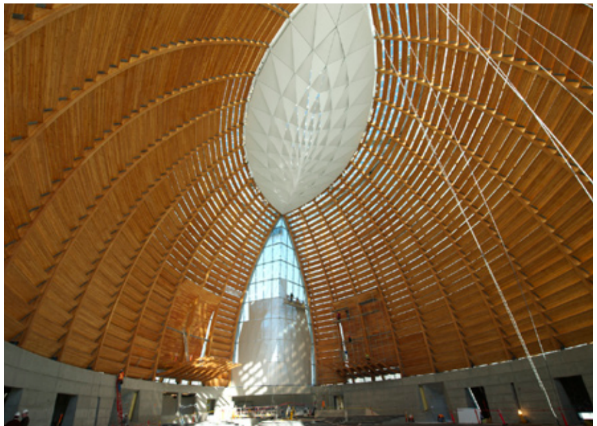
The floor plan of the building is in the shape of a Vesica Pisces creating a unique spherical elevation. The Vesica Pisces is a shape of religious significance, two intersecting circles of the same radius, connected in such a way that the center of each circle lies on the circumference of the other.