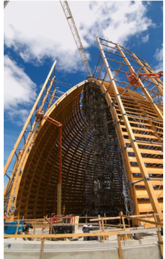
Given the asymmetry of structure and the curvature of the interior and exterior walls, very few connections were the same. As a result, AutoCAD 3D was utilized to model 220 unique connections.

First, the committee determined that the glulam timbers must remain elastic under cyclic load conditions. Second, all of the ductility of the system was required to come from the pre-tensioned steel rods. This required ductility testing of the tension members to demonstrate that they could achieve 2.1 percent elongation over the entire length of the rod, not just at the threaded ends. The rod manufacturer, Halfen Anchoring Systems, tested all five rod diameters. The initial testing pointed out that the two largest rod diameters did not meet this requirement as the elongation was limited to the threaded portion of the rod. Halfen therefore re-tooled their machinery to upsize the threads on these rods and achieved the required elongation. The resulting stress strain curves of the testing were input into the SAP2000 computer model to define nonlinear behavior of the structure. Third, the rods were required to be pretensioned to between 3 and 10 percent of their yield stress so that they were never loose and would be in tension immediately when loaded with seismic forces. The glulam supplier/erector, Western Wood Structures Inc. (WWSI), Tualatin, OR, developed an ingenious tightening sequence to eliminate force interference between rods. Without this sequence, tightening one rod would affect the forces already applied to all the other rods, tightening some and loosening others. WWSI also developed