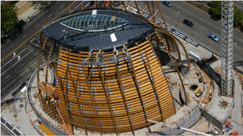
The oculus “skylight” weighs 24 tons. It had to be positioned exactly on target and then braced to prevent movement during installation of the glulam structure.